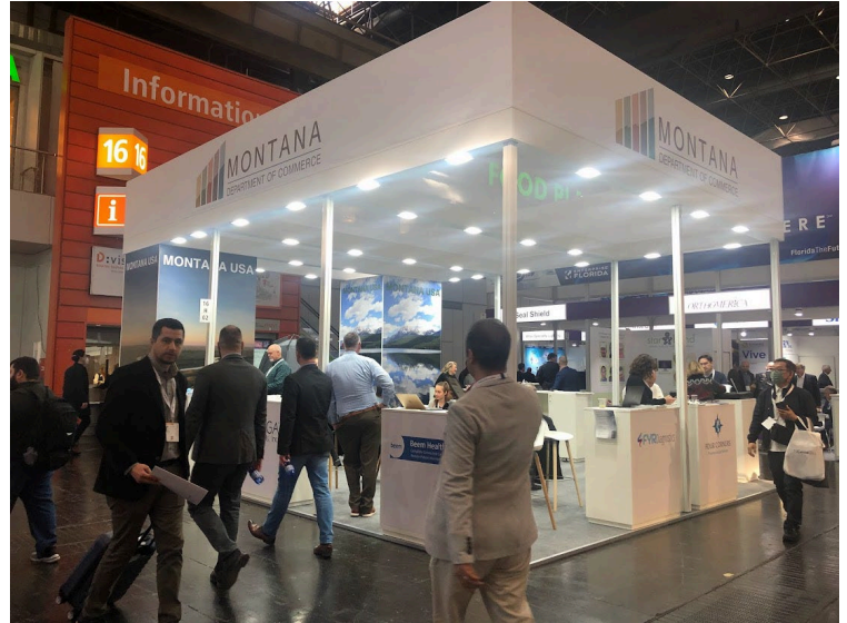
Montana Pavilion at Medica 2022

Our staff contracts for the booth space and provides all the booth amenities (furniture, electricity, etc.). Then you can promote your products and services from smaller kiosks within the booth and set up one-on-one business meetings. We will also provide some pre-show training and in-country staff support via staff.